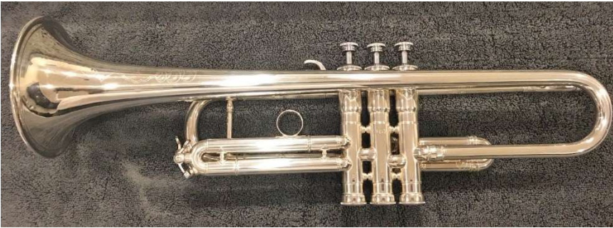
Champion model #6657