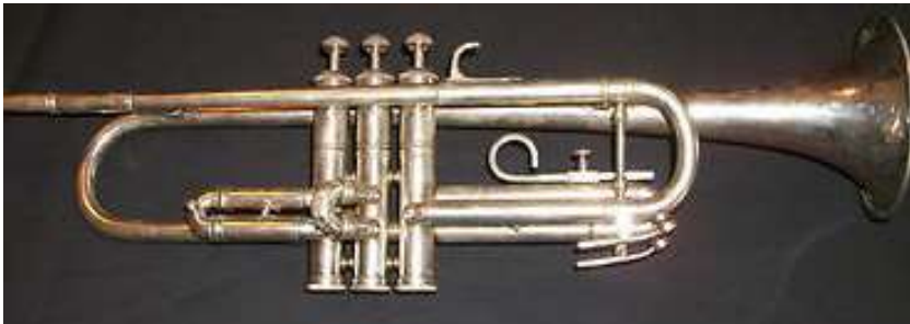
Professional model trumpet